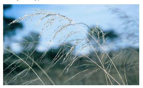
Figure 3. African lovegrass seed head. (M. Campbell)

African lovegrass prefers low fertility acidic or sandy soil types.