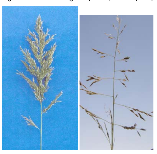
Figure 5. Consol lovegrass (left) and African lovegrass (right). (L. Pope)