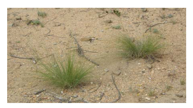
Figure 6. African lovegrass readily invades bare ground. (L. Pope)