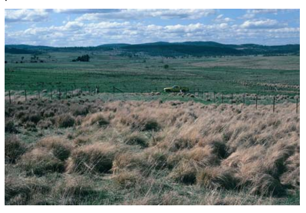
Figure 1. A heavy African lovegrass infestation. (M. Campbell)

African lovegrass (Eragrostis curvula) is a hardy, drought tolerant perennial grass species which thrives on sandy soils with low fertility. In some countries it is regarded as valuable for animal production and soil conservation but in others, such as Australia, it is regarded as a weed due to its low feed quality and acceptance by livestock. In Australia, seven agronomic types of African lovegrass are recognised. Its weed status depends on the environment in which it grows, the agronomic type and the land management being practised.