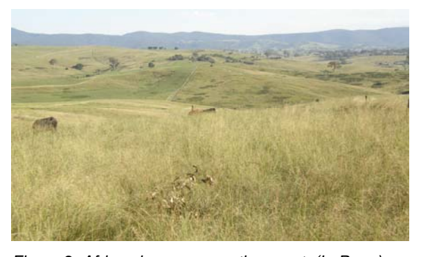
Figure 2. African lovegrass on the coast. (L. Pope)

African lovegrass can be found throughout New South Wales (NSW) on roadsides and is a major weed of grazing lands. It is distributed throughout mainland Australia.