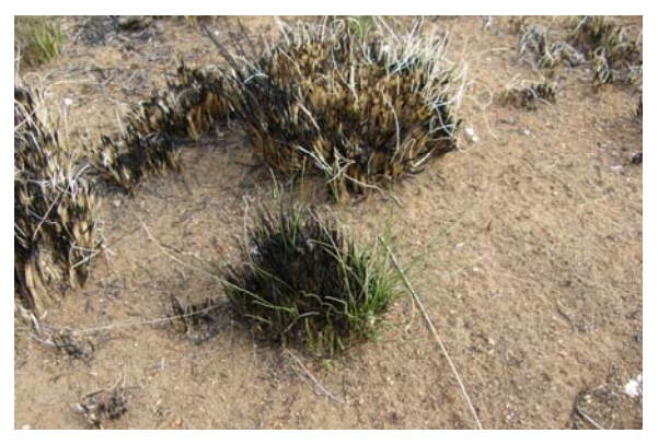
Figure 8. African lovegrass recovery following fire. (D. Alcock)

If direct drilling, aim to remove plant material by heavy grazing. Where a large bulk of material is present, burning may be necessary before spraying. A glyphosate-based herbicide can then be used to kill any re-growth once sufficient green leaf and active growth is occurring. This should occur in the spring prior to a planned sowing in autumn. A repeat application of glyphosate or other suitable herbicide may be necessary on the autumn break prior to sowing to kill any other weeds and new seedlings.