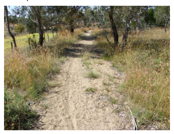
Figure 7. Lovegrass will often be found along farm tracks (L. Pope)

Weed seeds are easily transported in hay and fodder purchases. If purchasing hay from a known African lovegrass area then check it for any obvious signs of weed seed contamination. Supplementary feeding in a smaller 'sacrifice' paddock is also a good idea to minimise weed seed spread.